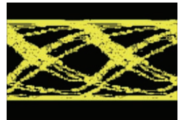
VScope Example Waveform

By plotting the BER across voltage and phase, a picture emerges that, with further processing, yields a map of the waveform edges similar a clock-triggered oscilloscope. The resolution of the waveform can approach that of outside test equipment. Because increased resolution implies greater overhead processing, VScope optimizes this trade-off between the amount of detail and performance.